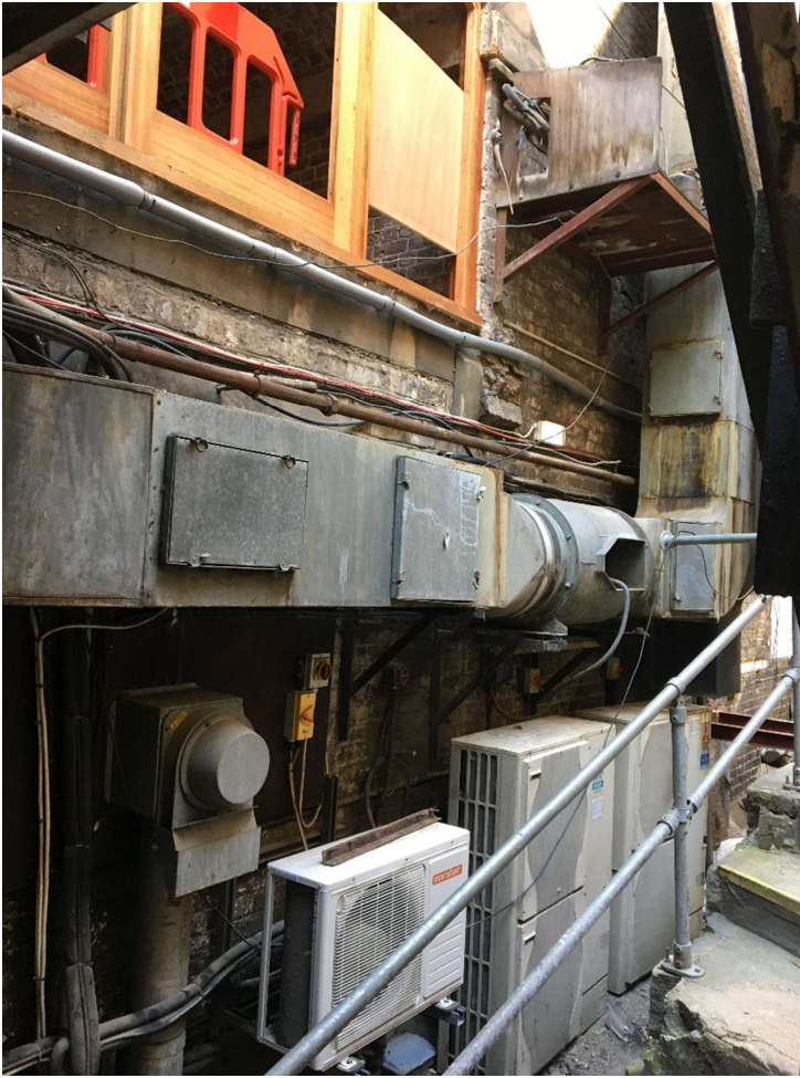
Photograph 7 – this photo gives an indication about the amount of mechanical plant situated within the ‘Terrace’ area, underneath and to the right of the new doors in photograph 2.