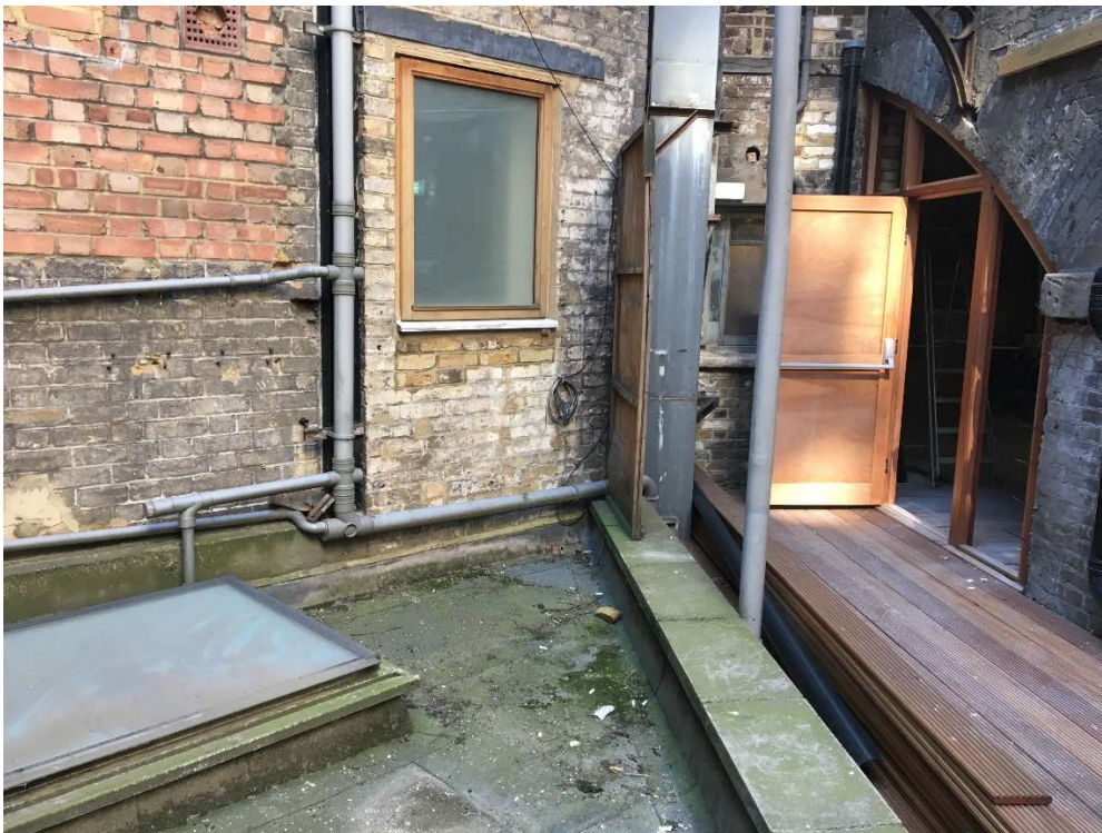
Photograph 1 - View of fire escape from Gremio bar area, renewed decking for the fire route, frosted window to residents' bedroom and roof light into another residential property window.

The following photographs illustrate the proximities of the residential receptors.