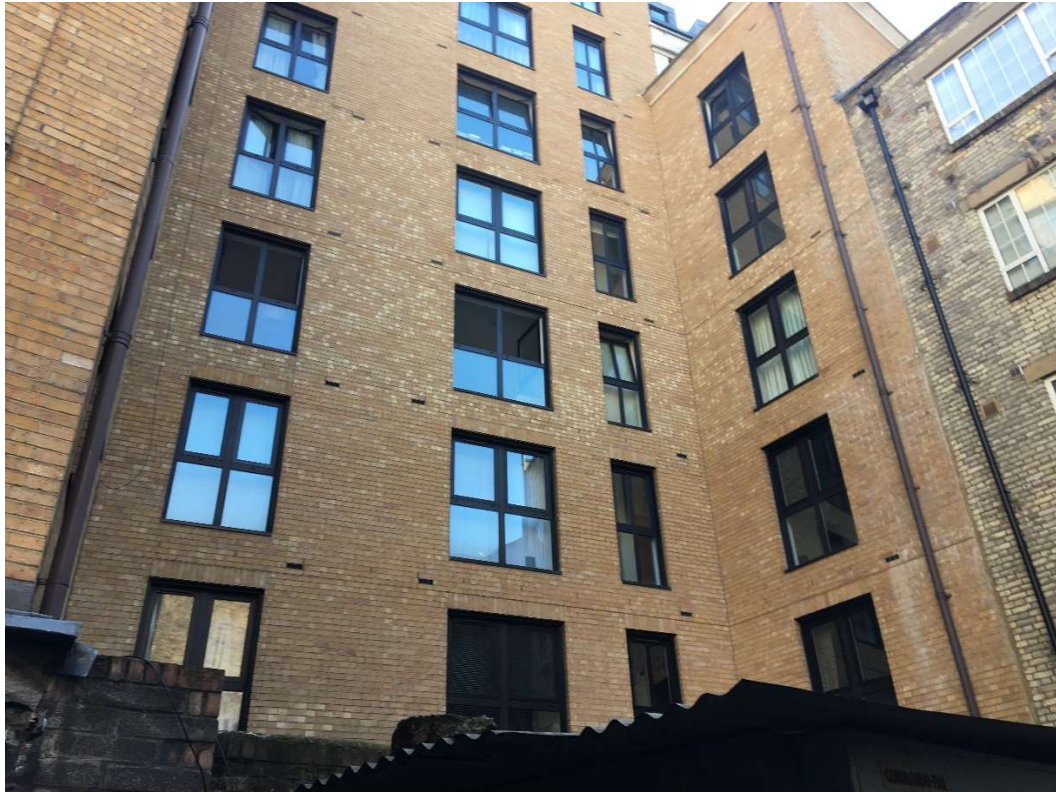
Photograph 5 – this photo shows the windows from 1 Pepys Street overlooking the ‘Terrace’ area, there are 90 residential units within this block of flats.