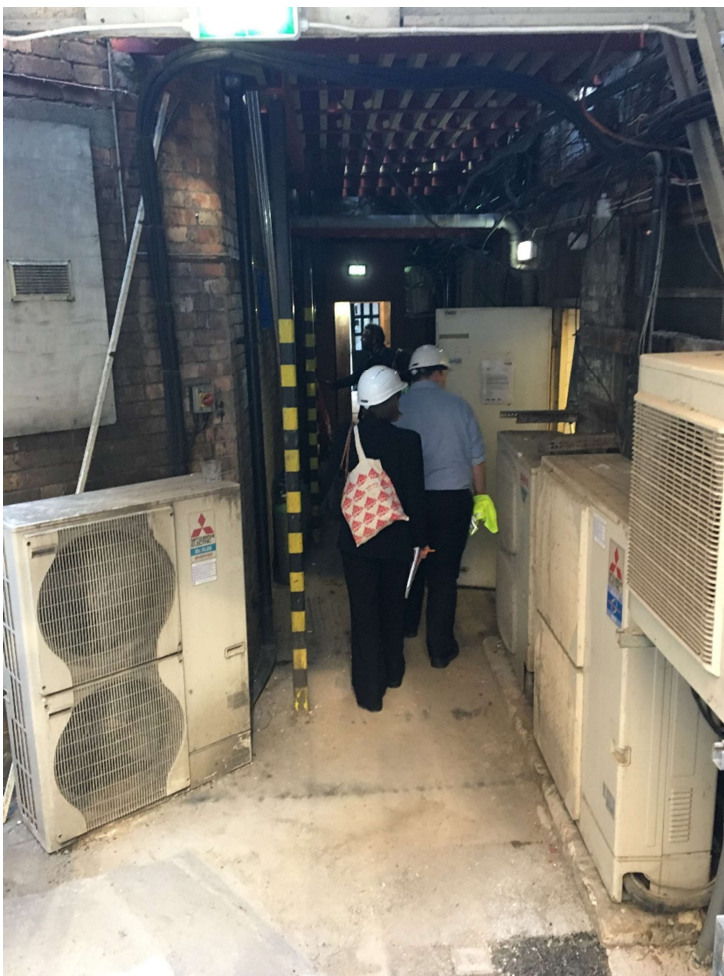
Photograph 8 – this photo is of the Fire route underneath the Fire Route decking as shown in photograph 1, this route exits out towards Savage Gardens. The white open door is Fire escape from the kitchens at the Bavarian Beer house. This photograph demonstrates the level of mechanical plant situated in this area, adding to the ambient noise levels.