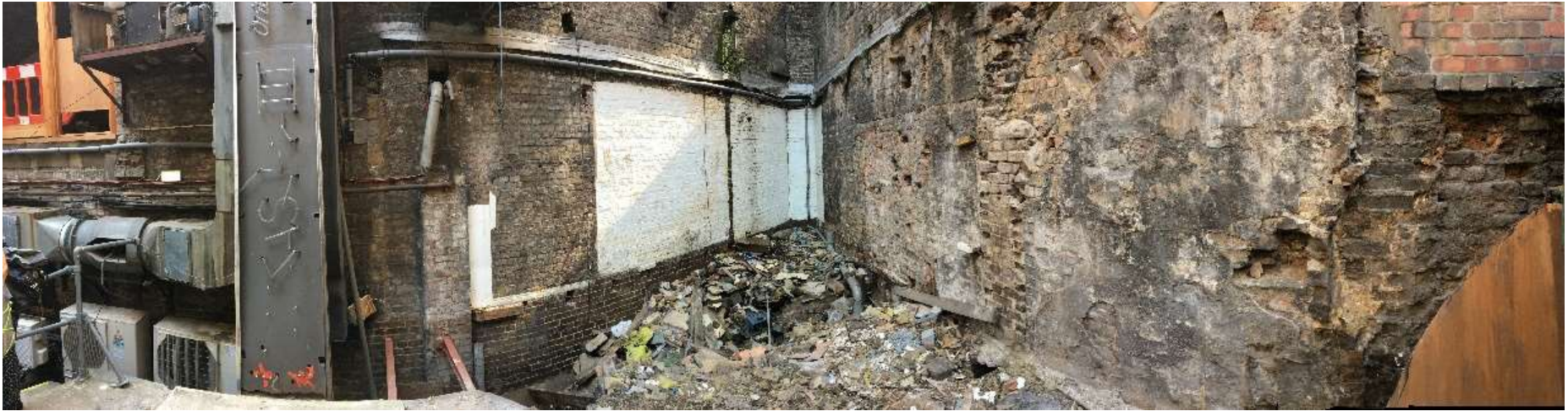
Photograph 3 - is a panoramic image of the current condition of narrower tapered end of the 'terrace'. In order to make this area safe work needs to be undertaken to level the land.