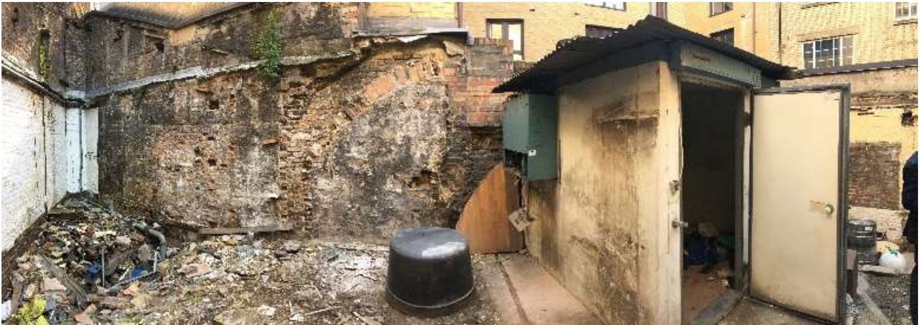
Photograph 4 - is a panoramic view of the wall looking south toward the residential properties at 1 Pepys Street and Savage Gardens, behind a disused storage shed.