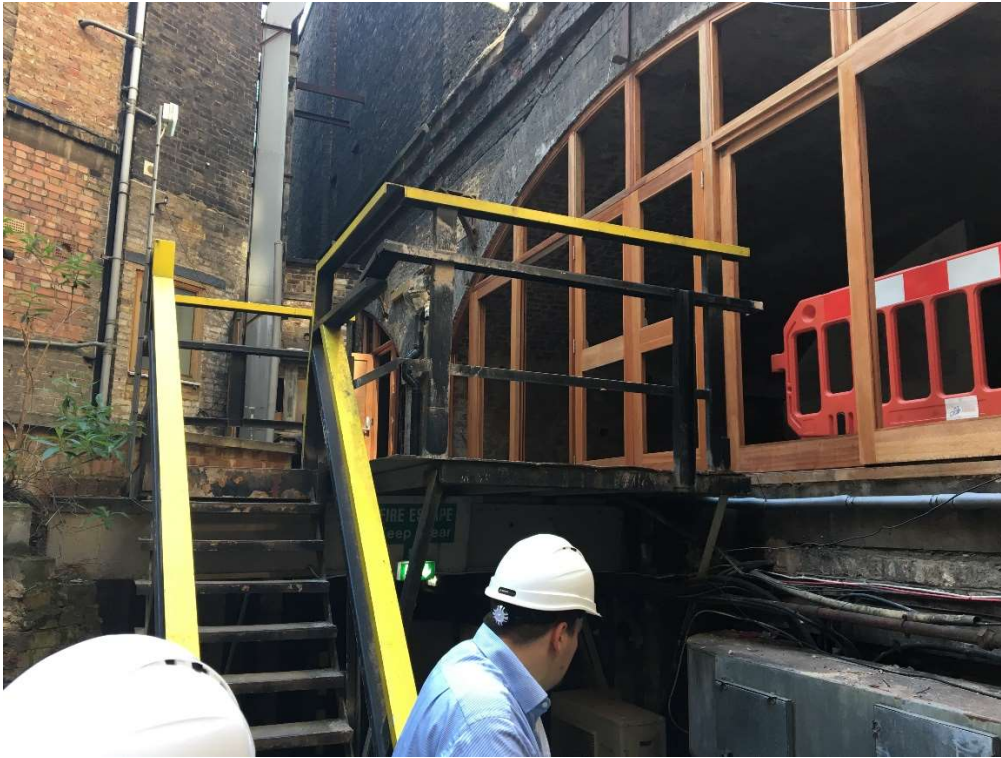
Photograph 2 - Again shows the decking area / fire route from the bar area, the residents bedroom window and the new doors which have been installed into the archway, which consist of 2 sliding doors and a set of central fire doors. This photo also shows the stairs to be used in the event of a fire, or to access the 'terrace' as detailed in Image 1.