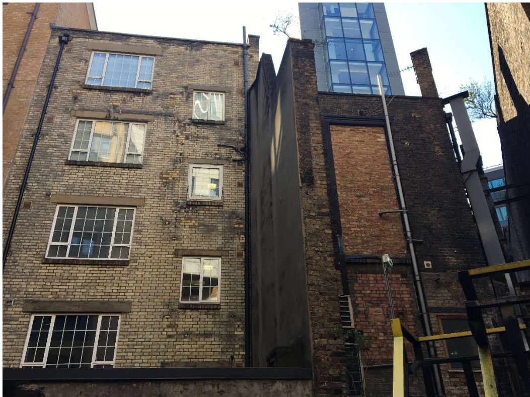
Photograph 6 – this photo shows the residential properties overlooking the ‘Terrace’ area from 25 Savage Gardens, there are 5 residential properties within this block.